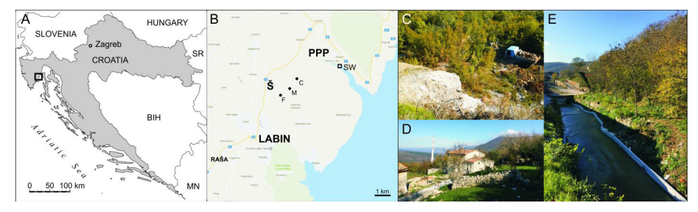
Figure 1 Map of the study area, (A) geographical position (square) (B) sampling sites: Š (Štrmac) – the A (SHOS) site; SW – seawater (Plomin Bay); F, M, C – foliage, mushroom and clover sampling sites, respectively (C) field situation at the Š site, (D) the plant sampling site (PPP's stack is some 700–900 m away) (E) surface municipal effluent water (water samples for sulphate analysis) located in the Raša and Krapan towns [Figure 1B; Krapan is located 1–2 km NE of Raša] (see online version for colours)

A small village of Štrmac came out of anonymity at the 1880s when the nearby coalfields were discovered. In the vicinity of a coal mine, lots of buildings (houses, shops, factories, etc.) soon appeared. They had lasted until 1955, when the last tons of coal were excavated. Five years later, the coal-fired power plant's stack together with a mining tower were demolished. Furthermore, the activity of an old local foundry had gradually declined. Today, mostly descendants of miners live there. Also, the A (SHOS) site serves as a landfill for various non-hazardous wastes (Figure 1C).