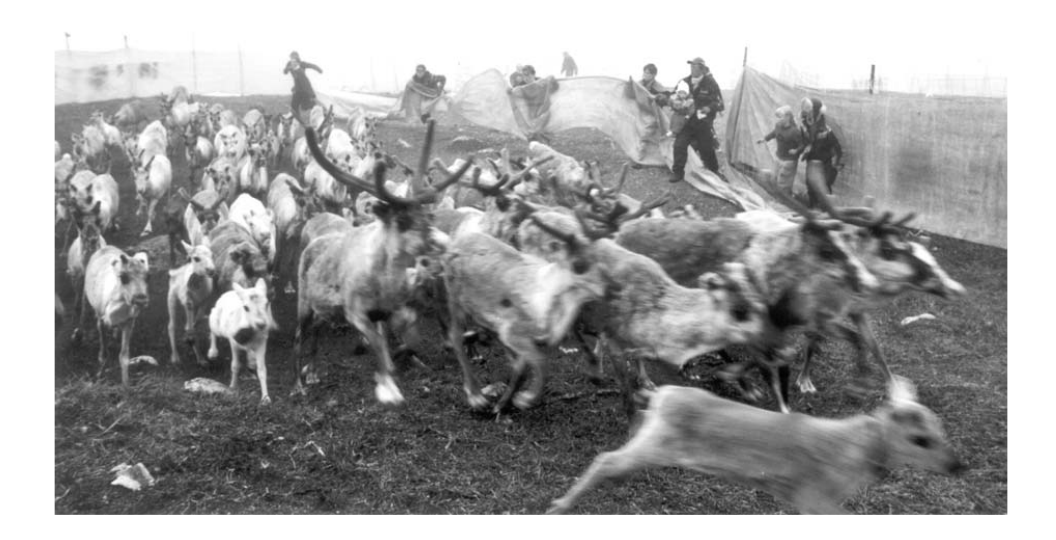
Figure 1 Extended family at spring round-up

While herding continues to be a communal activity, the individual ownership of each reindeer remains private. The question arises, however, "What is the impact of globalisation on the Sámi?" The objective of our study was to address this.