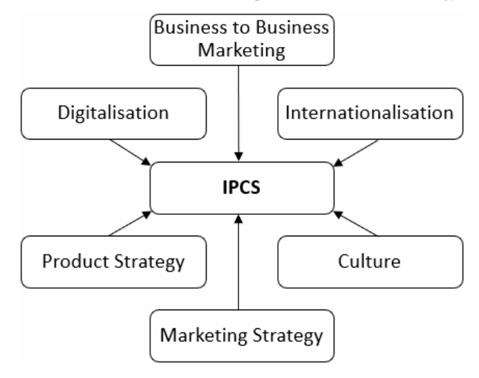
Figure 1 Theoretical framework for international product customisation strategy