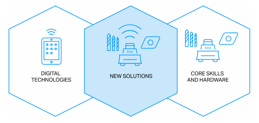
Figure 3 Digital transformation of manufacturing in SteelCorp (see online version for colours)