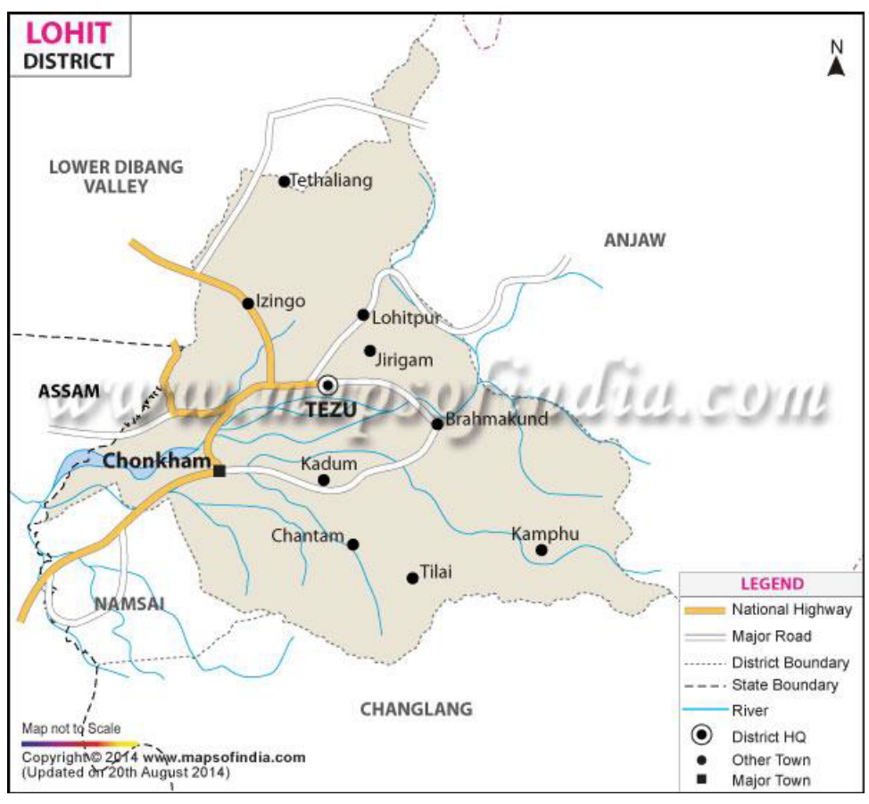
Figure 1 Map of study area (see online version for colours)

settlements like Paya and Dening in the north, Chowkham in the west, Demwe in the east and Kharem and Kadum in the south. Both Arunachal Pradesh Schedule Tribe (APST) and non-APST population inhabit the township.