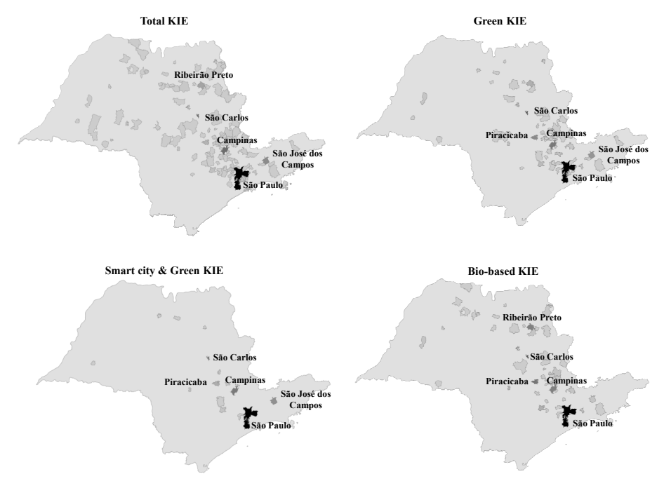
Figure 2 Geographical distribution of KIE projects