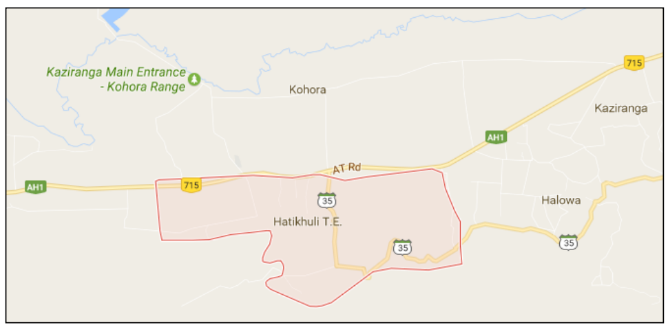
Figure 1 Geographical location of the Hathikuli Tea Estate (see online version for colours)