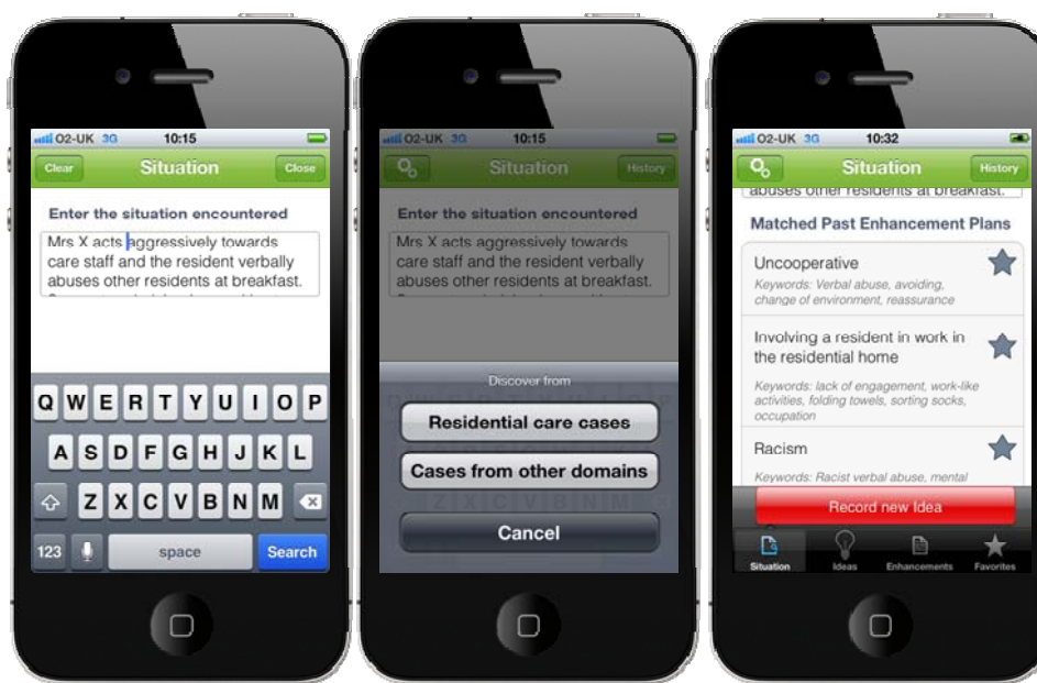
Figure 2 Describing a care situation and receiving care cases retrieved by the case-based reasoning service in Carer (see online version for colours)

Figure 3 shows how users can read each selected case. Each case is described and presented in text form in two parts – the situation that was encountered and the care plan enhancement that was successfully applied – that the user is able to scroll between. The left-hand side of Figure 3 shows one case retrieved for our example situation in the care domain – it described how care staff elsewhere successfully resolved a situation with an uncooperative resident. The right-hand side shows a case retrieved using the analogical matching discovery service. The case is taken from the policing domain, and describes plans that were successfully implemented to handle challenging situations when arresting drunken people.