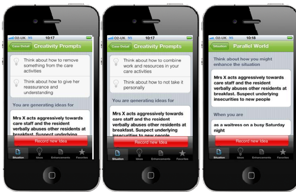
Figure 4 Example creativity prompts generated by the creativity prompt generation service and presented by the app (see online version for colours)

Care staff can also, at any time, edit and manage their pool of ideas, as shown on the left-hand side of Figure 5. They can also select and order these ideas to construct a new care enhancement plan. The example plan on the right-hand side of Figure 5 shows a plan composed of three ideas and one comment: the plan orders the ideas in their sequence of implementation – to understand reasons for verbal abuse , then understand the situation from the perspective of the resident , then collect personal items to make her more at home . A text comment added to the plan suggests generalising the plan to all new residents .