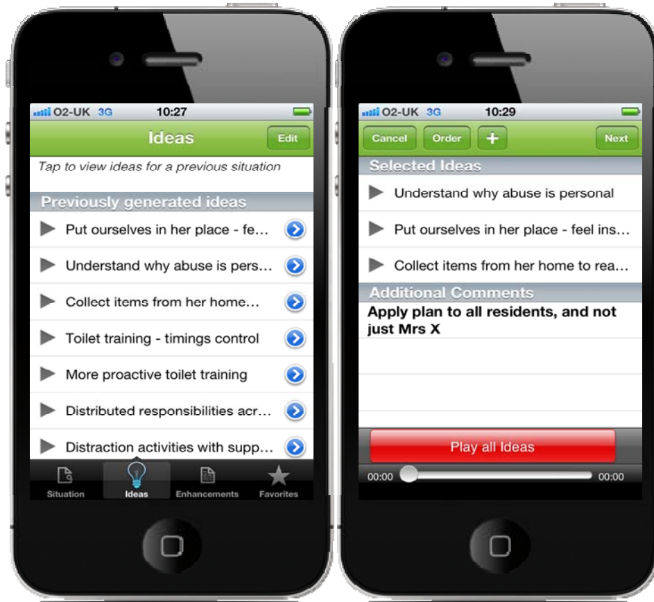
Figure 5 A care enhancement plan constructed from ideas to resolve the care situation described in Figure 2 (see online version for colours)