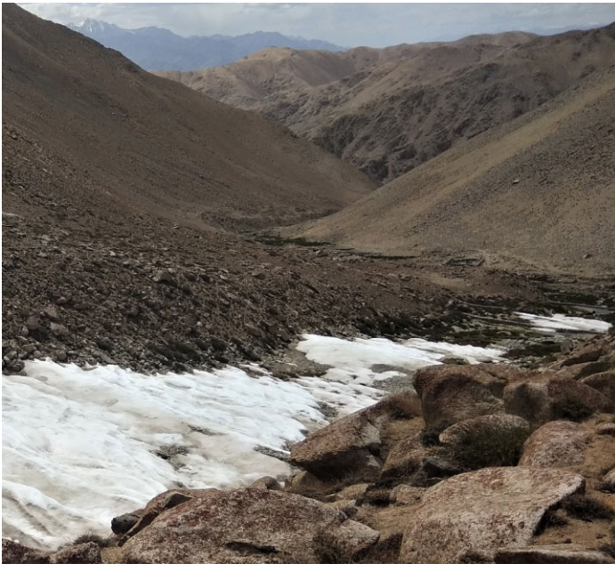
Figure 3 Artificial glacier (see online version for colours)

Chewang Norphel from Ladakh known as ‘Ice Man of India’ invented artificial glacier in 1987 to address the problem of scarcity of water. Artificial glacier is a technique to harvest the wastewater during the winter to store it in the form of ice. Such glaciers have been created at relatively lower altitudes as a result they melt earlier than natural glaciers and thus provide water for irrigation during the critical first months of the growing seasons, i.e., April and May (Daultrey and Gergan, 2011).