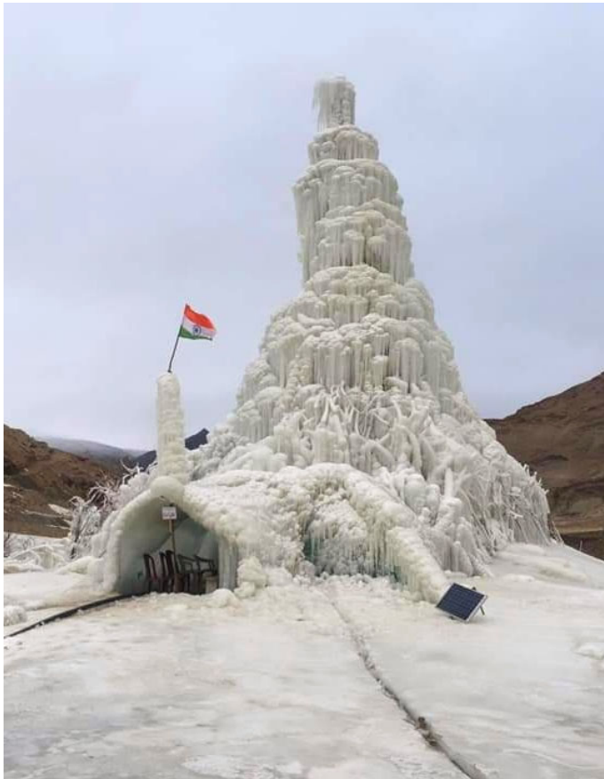
Figure 4 Ice stupa (see online version for colours)