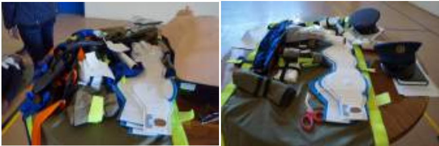
Figure 16 Pack four during testing (see online version for colours)

In response to these findings from user studies, a process of ideation was applied to develop a new, compartmentalised solution that encouraged easy access, transportation, organisation and use. The new solution was in the form of a corrugated plastic box, with eight individual compartments (Figure 17). The box enabled easy transport due to its stackable design and presented a low-cost, easy-to-manufacture alternative to the existing bag design.