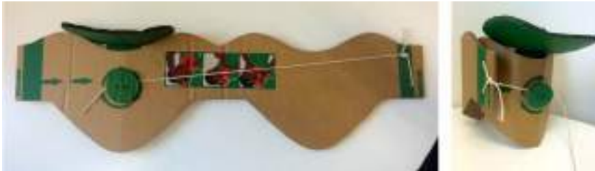
Figure 5 The cervical collar used in the Zambia pack , made from corrugated card, string, and zip ties, screen printed and coated with bees wax (see online version for colours)

materials and manufacturing processes in the European context. The new cervical collar design, developed for the Namibian context recognised both Namibia's high cost of labour and capacity for large-scale manufacture, and also adopted the key interaction design elements included within the Zambia collar.