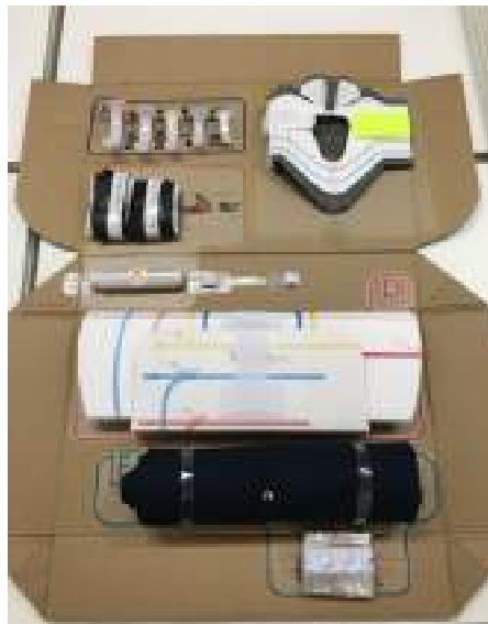
Figure 2 The European pack prototype, intended for single person, single use and including an 'adjustable' plastic cervical collar and leg splint (see online version for colours)