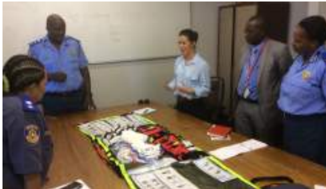
Figure 6 Meeting with Windhoek city police (see online version for colours)

Conversation with the MVA identified Windhoek (Figure 7) as the most appropriate location for the field trials in the next phase. According to the MVA Windhoek reports 43% of all registered vehicles and 53% of crashes (MVA, 2019).