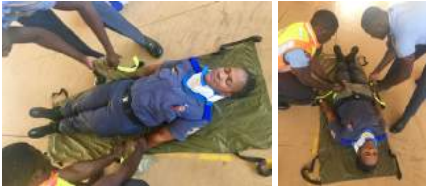
Figure 19 Testing the revised collar (see online version for colours)

During this round of user testing, re-developed packs were tested by 160 users, using scenario-based user testing methods and a 'Think Aloud Protocol' (Yen and Bakken, 2009). These tests confirmed that users were able to successfully apply each component of the pack with ease.