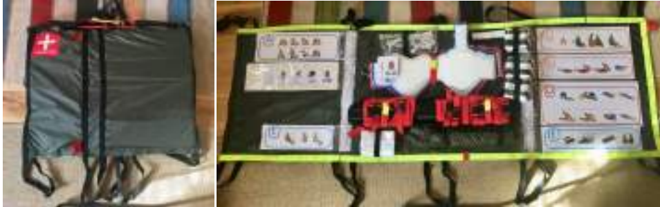
Figure 4 The demonstrator pack , a multiple person and multiple use pack with removable instructions (see online version for colours)

material selection and manufacturing processes selection reflecting consideration of Planet and Profit. This pack was designed prior to visiting Namibia as a tool to aid discussion and access key stakeholders. It was not intended that this pack be used as the final concept in Namibia. This process of evaluation continued throughout the design process.