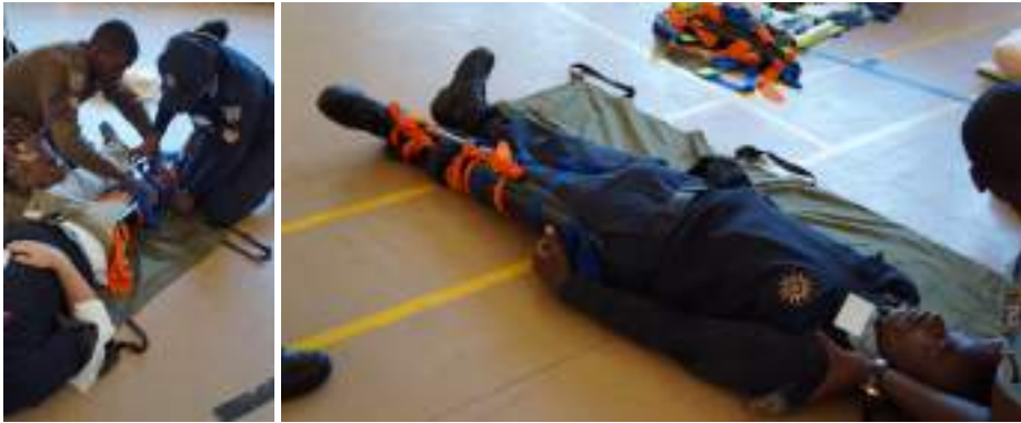
Figure 11 The revised splint design (see online version for colours)