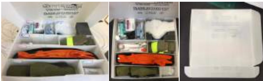
Figure 17 Low-fidelity, rapid prototype of new pack design (pack five) (see online version for colours)

With BCB International's support, the new design was costed and developed for manufacture (Figure 18). The intention had been to produce the new designs from a corrugated plastic, a versatile material which would provide water resistance and durability. Unfortunately, the low volume required resulted in high production costs, and a need to manufactured the boxes from cardboard instead of corrugated plastics, however, all other factors presented a true reflection of the intended final concept.