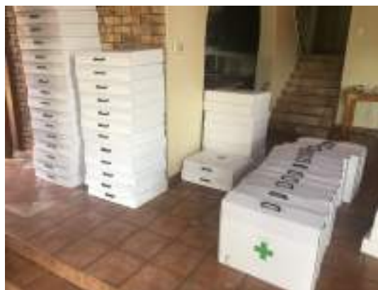
Figure 20 The pack five ready for shipment (see online version for colours)

In October 2017, 60 packs (Figure 20) were manufactured and shipped to Namibia where they were distributed for use by the Namibian Police Force and Windhoek City Police. The aim of the study was to collect data on the real-world use of the pack in context: each officer was given a pack which was to be stored in the boot of their police vehicle. All the officers equipped with a pack had already been trained in its use. The intention of the trial was to monitor what actually happened in use.