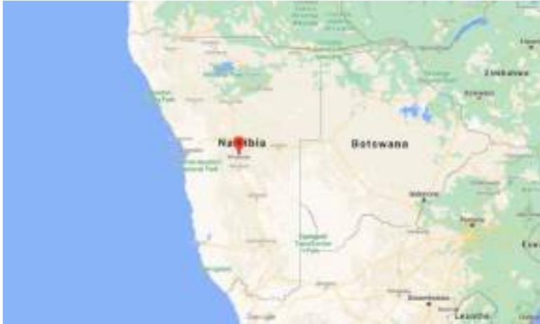
Figure 7 Location of Windhoek in Namibia (see online version for colours)

Location of Windhoek in Namibia [online] https://www.google.co.uk/maps/place/Windhoek,+Namibia/@-22.3096253,15.404699,6.13z/data=!4m5!3m4!1s0x1c0b1b5cb30c01ed:0xe4b84940cc445d3b!8m2!3d-22.5608807!4d17.0657549 (Accessed 2 June, 2021).