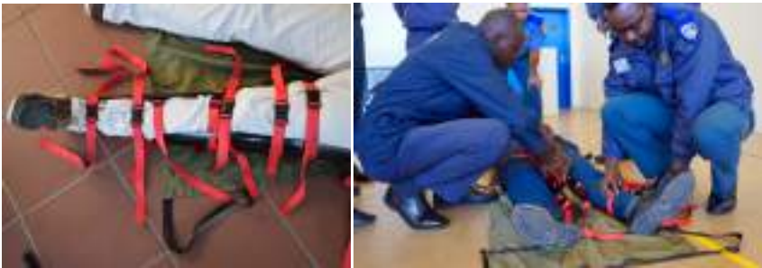
Figure 10 The original splint design (pack four) (see online version for colours)

During the first week of testing key usability challenges were identified with the splint design. The original design (Figure 10) required the user to apply two splints, one to either side of the leg. These were then fastened in place with the use of webbing straps and buckles.