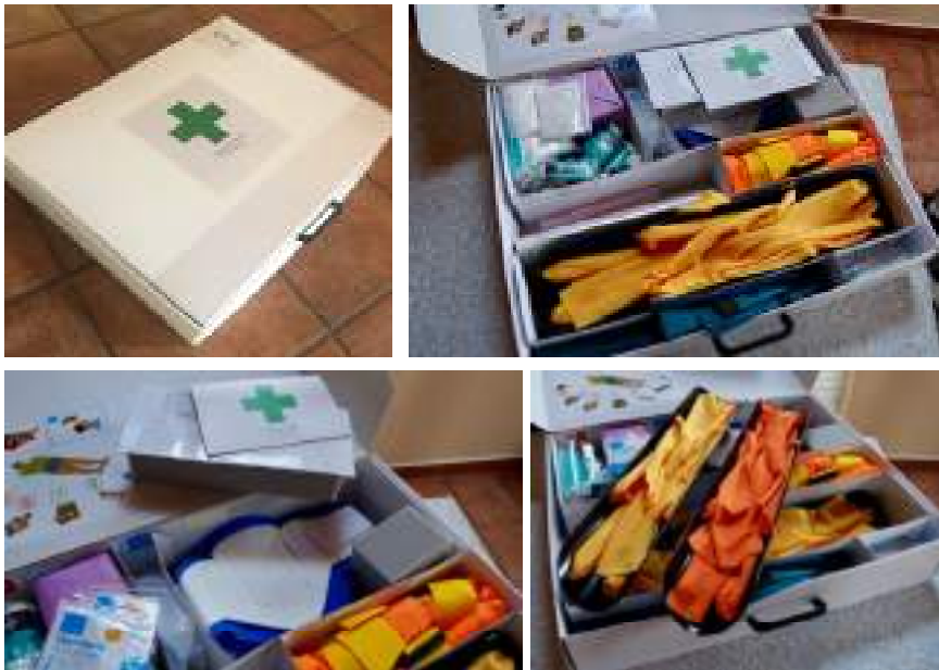
Figure 18 Pack five, the final design (see online version for colours)