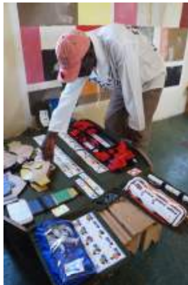
Figure 1 The Zambia pack , a multiple person, multiple use pack composed of cardboard cervical collars and drainpipe leg splints in user testing (see online version for colours)

A key difference between The Zambia Pack (Figure 1) and The European Pack (Figure 2) lies in the radically different production economics and manufacturing realities of Western Europe and rural Zambia. While The Zambia Pack prioritised the use of low cost, low tech materials and manufacturing processes at the expense of high (and cheap) labour input, The European Pack was carefully designed to enable low-cost mass manufacture in the European context where labour costs are more likely to be a deciding factor. Developed with the British Ministry of Defence (MoD) input, The European Pack is about to enter production with BCB International.