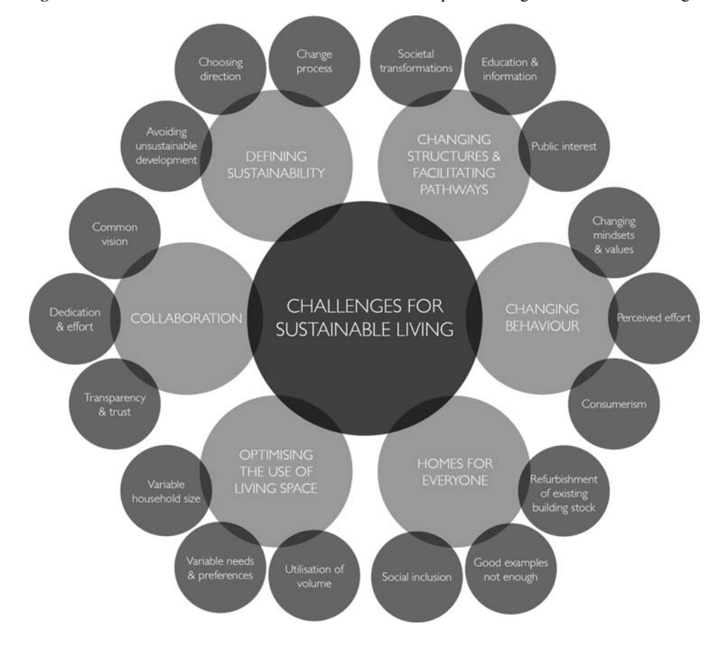
Figure 2 An overview of the themes discussed under the topic 'challenges for sustainable living'

Lack of transparency in the project management processes was brought up as an obstacle by researchers, enablers and providers. A somewhat unclear mandate was explained by one of the researchers as making it difficult to know what it is possible to do and what it is not, but also who you should turn to for different matters. A suggestion by one of the providers was that the university could operate as a neutral bridge, not only between partners and researchers, but in a second step facilitating collaboration between the different partners as well.