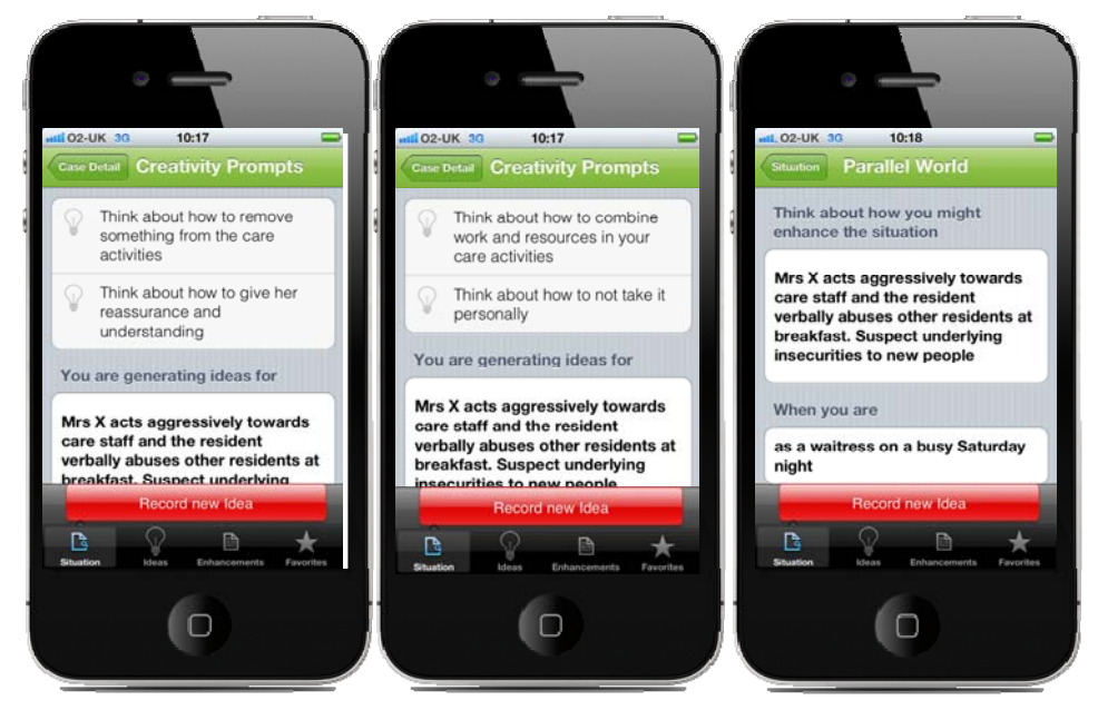
Figure 4 Example creativity prompts generated by the creativity prompt generation service and presented by the app (see online version for colours)

Care staff can also, at any time, edit and manage their pool of ideas, as shown on the lefthand side of Figure 5. They can also select and order these ideas to construct a new care enhancement plan. The example plan on the right-hand side of Figure 5 shows a plan composed of three ideas and one comment: the plan orders the ideas in their sequence of implementation – to understand reasons for verbal abuse , then understand the situation from the perspective of the resident, then collect personal items to make her more at home. A text comment added to the plan suggests generalising the plan to all new residents.