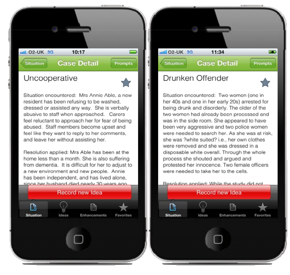
Figure 3 Cases descriptions retrieved by the case-based reasoning discovery and analogical matching discovery services, and presented by the app (see online version for colours)

Furthermore, at any time, care staff can also explore different other worlds in which to generate new ideas without the constraints of the care domain. An example of this guidance is shown on the right-hand side of Figure 4. The user is encouraged to think about how to solve the aggression situation as a waitress on a busy Saturday night . Again, a simple flick of the screen will generate a different other world, such as parachuting from an aircraft .