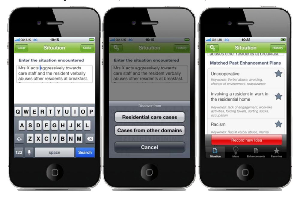
Figure 2 Describing a care situation and receiving care cases retrieved by the case-based reasoning service in Carer (see online version for colours)

Figure 3 shows how users can read each selected case. Each case is described and presented in text form in two parts – the situation that was encountered and the care plan enhancement that was successfully applied – that the user is able to scroll between. The left-hand side of Figure 3 shows one case retrieved for our example situation in the care domain – it described how care staff elsewhere successfully resolved a situation with an uncooperative resident. The right-hand side shows a case retrieved using the analogical matching discovery service. The case is taken from the policing domain, and describes plans that were successfully implemented to handle challenging situations when arresting drunken people.