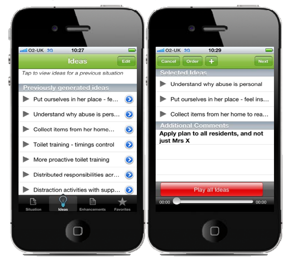
Figure 5 A care enhancement plan constructed from ideas to resolve the care situation described in Figure 2 (see online version for colours)