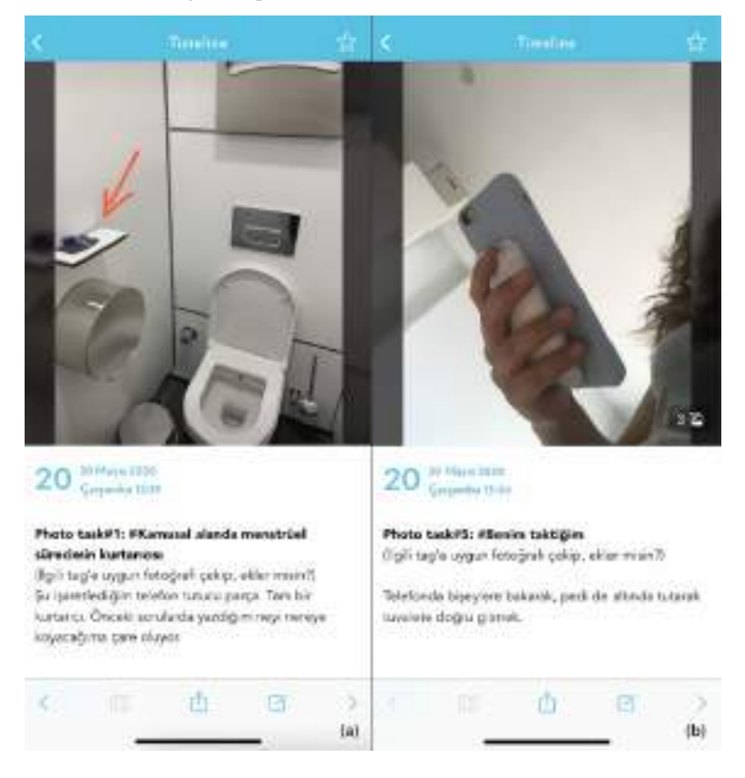
Figure 3 (a) A participant explains that such surfaces are lifesavers for menstruation and (b) a participant hides her menstrual pads behind her mobile phone and makes it look like she is looking at the phone (see online version for colours)