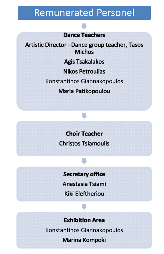
Figure 2 Remunerated personnel (see online version for colours)

From the presentation of the organisational structure of the KLCoGW, we note that each person's role is clear, which facilitates the responsibilities of each sector and the coordination of tasks. Another highlight is the voluntary contribution to the organisation of the KLCoGW. The members of the board of directors support the ephorates without any remuneration and provide every possible help with the various tasks and productions.